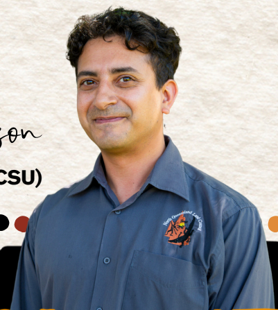
Coordinator PBC Support Unit (PBCSU)