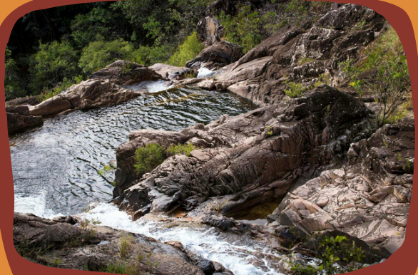
Image courtesy of Tropical North Queensland. This photos is not our own. Taken at Halls Falls.