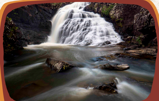
This photos is not our own. Taken at McKenzie Falls.