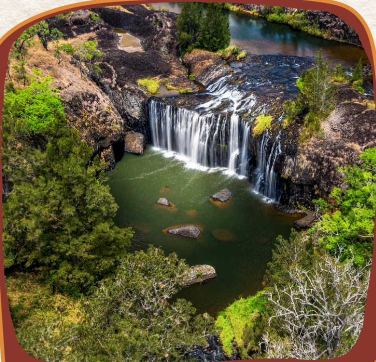
This photos is not our own. Taken at Millstream Falls.

Though parts of the Jirrbal #4 claim area remain on foot in the Federal Court, and there is still work to be done, this determination is nevertheless a significant achievement for the Jirrbal People and in particular for their Elders past and present. The NQLC is planning to organize a celebratory event later this year to mark this achievement and the invaluable contributions of the Jirrbal Elders. Details will be unveiled as plans unfold.