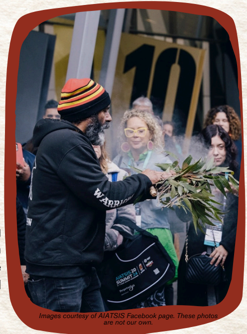
Images courtesy of AIATSIS Facebook page. These photos are not our own.

We aim to incorporate cultural activities and learning opportunities on country for young men and women. These initiatives will provide a platform for both to actively participate in and benefit from NQLC's work. We encourage our Members to consider ways to involve the younger generation, fostering a deeper connection to native title and our shared heritage.