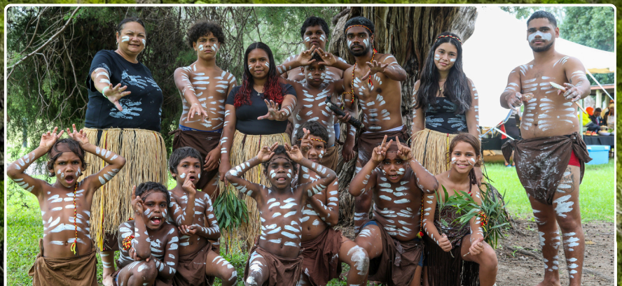
Gooliwana Bana (Wild River) Dancers